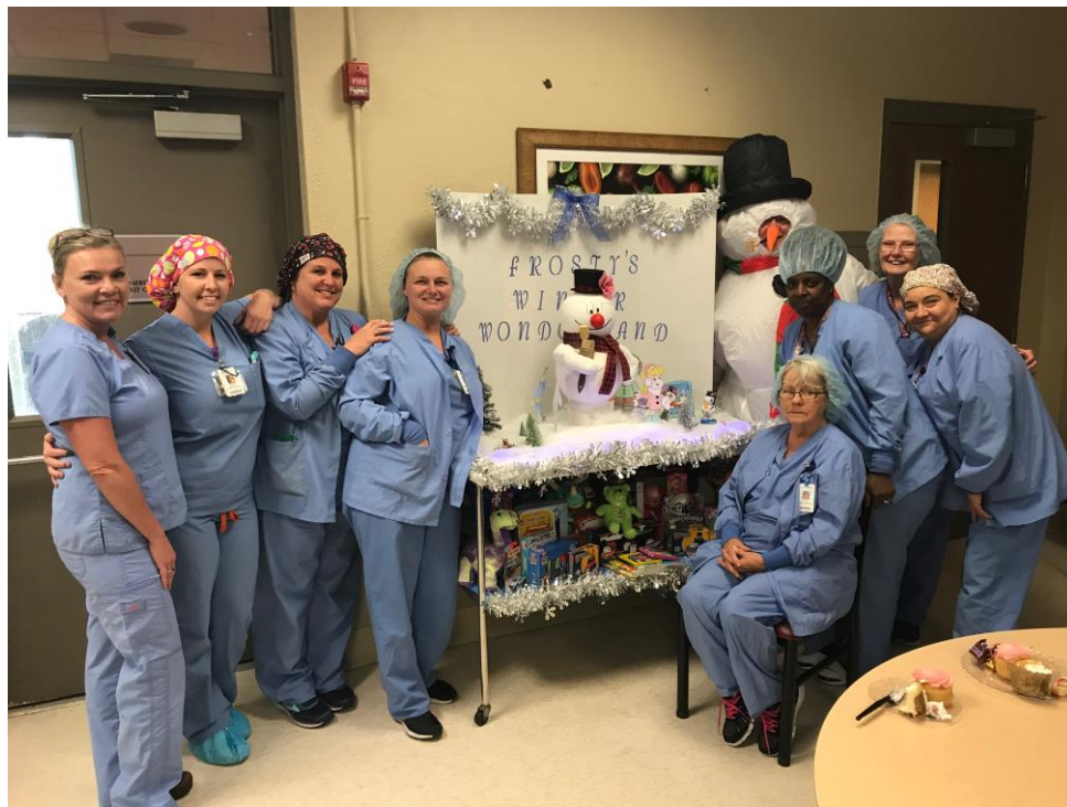
Lake Wales Medical Center is owned in part by physicians.